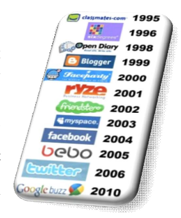
History of Social Networking Sites

The social networking sites phenomena started to become popular in the mid of 1990s. One of the first was Classmates.com, launched in 1995 (Figure). Friendster is another social networking site, it was established in 2002 and focused on dating, LinkedIn was founded in 2003. It allowed